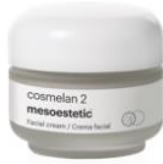
cosmelan® 2 maintenance cream

Home treatment supplementing cosmelan® 1 that reduces spots continuously and regulates melanin overproduction to prevent their reappearance.